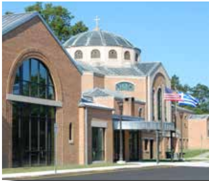
Saint Barbara Greek Orthodox Church 480 Racebrook Road, Orange, CT 06477

Watch the entire interview at: https://www.youtube.com/watch?v=vBMX2ex1qIA&feature=youtu.be