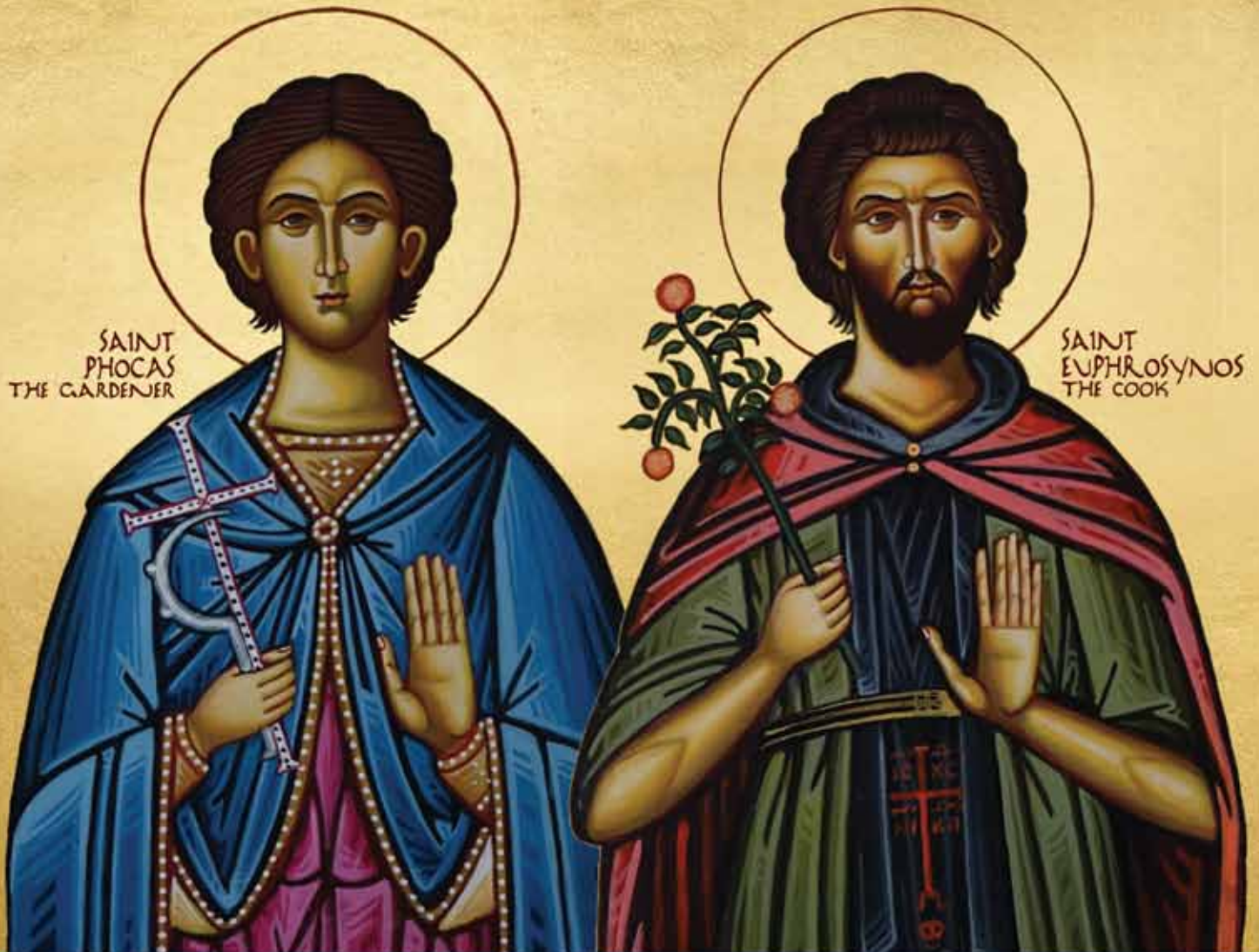
SAINT PHOCAS THE GARDENER